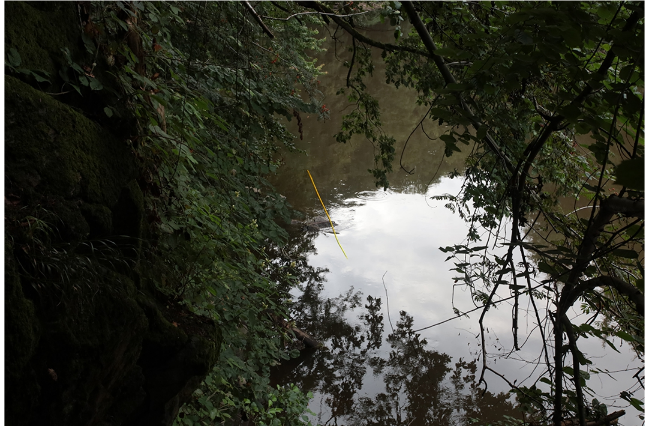
One World One Painting

As a whole, One World One Painting can never be experienced in one moment, but only through movement and time. The invitation to participate is extended to a social media platform, which displays existing elements of the installation in a precise location and invites viewers to add their own individual elements. In addition to showing the connections between the picture elements, openness should be created among the individual people. The floating lines come together in communication with their surroundings and constantly change into different perspectives. The environment and its effects are thus brought to the foreground.