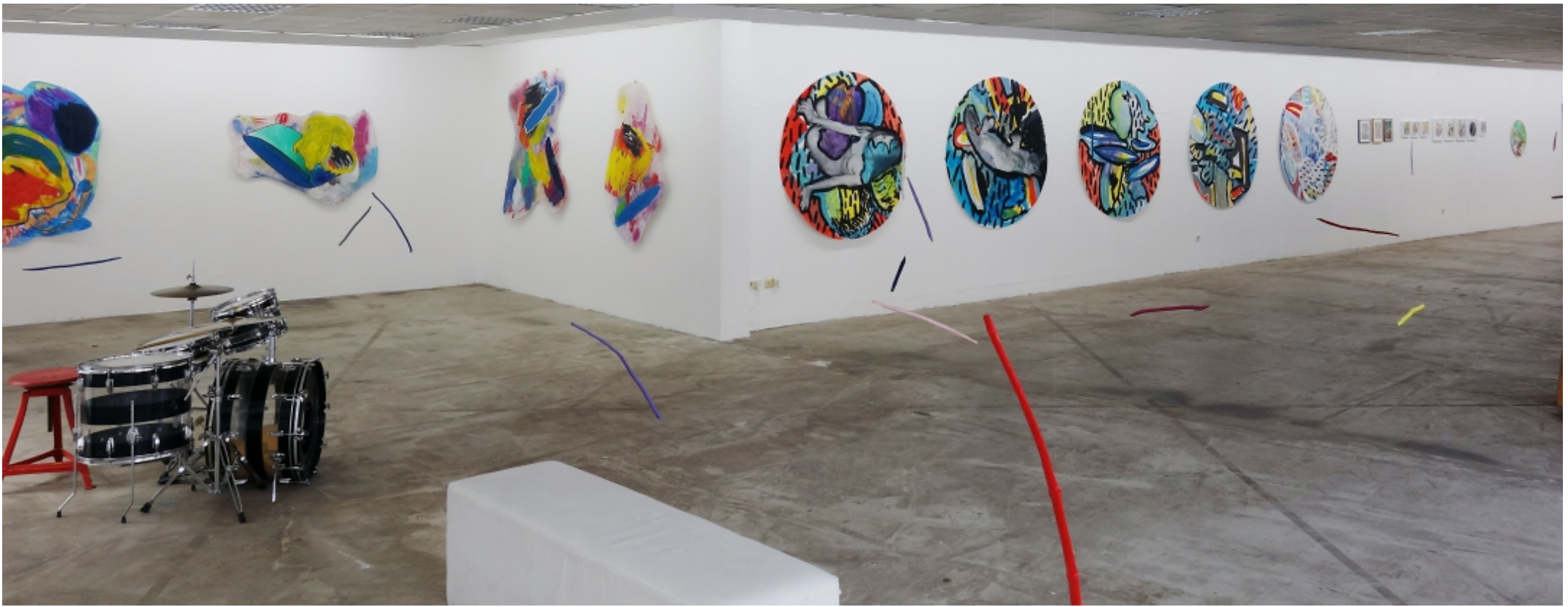
Like A Comet - Velvety Crashing Into a Pond (performance)